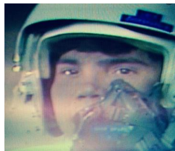
Pictured above at the NF Air Base in September of this year, and flying in a F4 Phantom Jet in 1984. A work career of over 40 years!