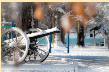
"The Waiting Game"