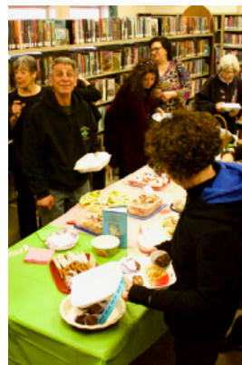
Participants selecting their desserts