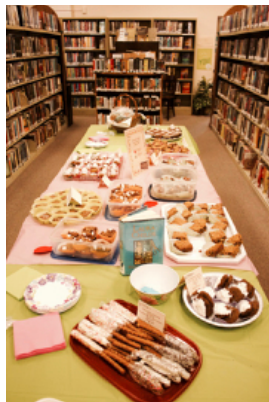
A wide selection of desserts and appetizers