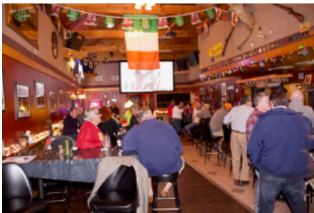
The Mug and Musket Tavern