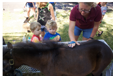
Shenandoah Acres petting farm, 2016

The Town of Porter Story Hour hosts a summer program offering entertainment for the entire family from 10:00-11:00 a.m. on Tuesdays at the Youngstown Village Center Gym and on Wednesdays at the Ransomville Free Library . Various musicians, puppeteers, magicians, petting farms, and more will be on the schedule this year. This is a free program and no registration is required. Stop by the Library to pick up a calendar of events, or check the Town of Porter Story Hour Facebook page for dates and details.