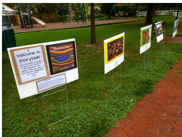
Storywalk® at the Festival

The Friends contributed to the Youngstown Art and Music Festival again this year by contributing a Storywalk® featuring the book Market Day by Lois Ehlert, and a “Little Library” area for children. Chairs and donated puzzles and used books were available in the Little Library for children to sit and read. Thank you to everyone who stopped by!