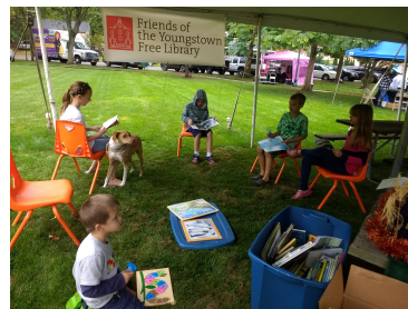
Children reading in the Little Library